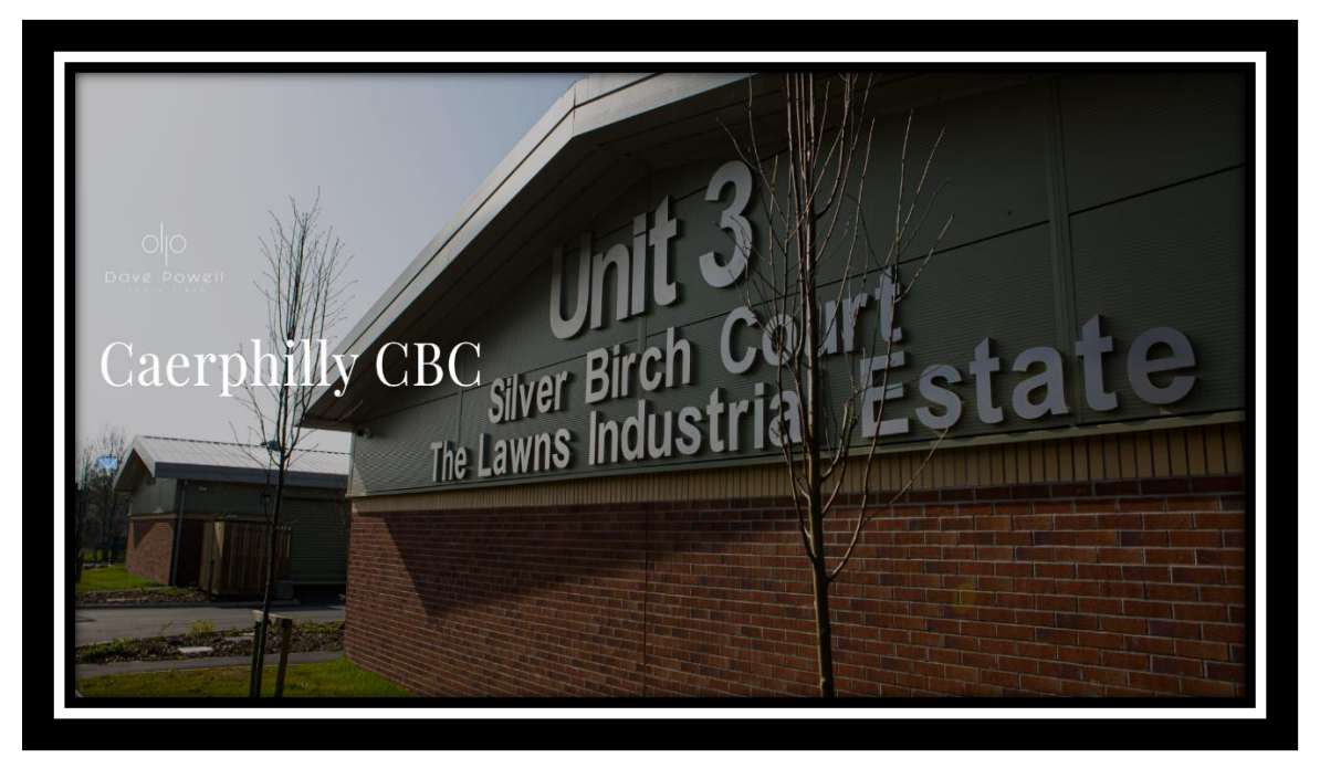
17.- The Lawns- Silver Birch Court