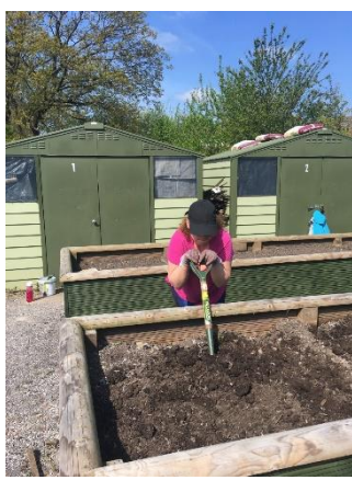
2. Tarragon Centre, Bargoed