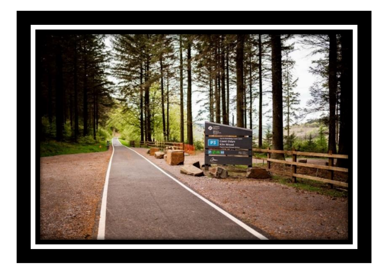
14.- Refurbished Cwmcarn Forest Drive- Reopened in

Following significant investment from Natural Resource Wales, Cwmcarn reopened the forest drive in June 2021 after it closed in 2015 to allow for the felling of 150,000 trees affected by the disease Phytophthora Ramorum. The reopened drive incorporates seven car parks to allow visitors to absorb the breathtaking panoramic views of the surrounding countryside, three new adventure playgrounds for children to enjoy, together with sensory tunnels, a woodland sculpture trail and several all-ability trails.