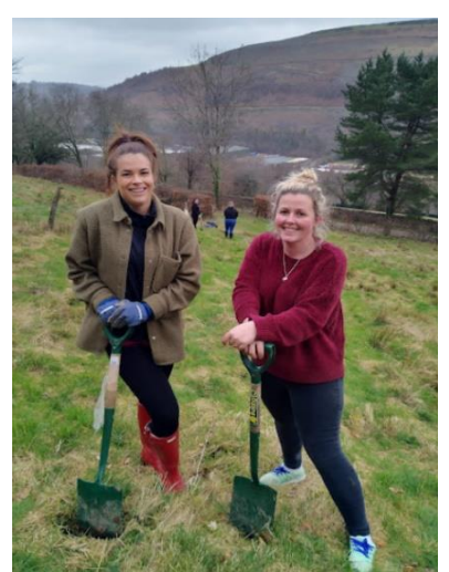
20. Tree planting