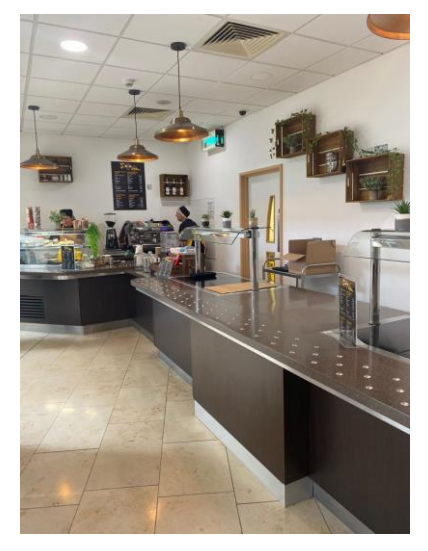
27.-Ty Penallta Café area 2

26.-Ty Penallta Café area 1 Return to main contents page