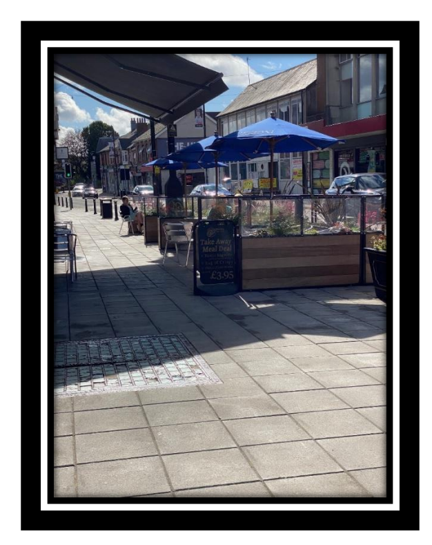
10- High Street modifications- New Parklet

Our Business community has had to adapt quickly, and local and national government support had to be rolled out quickly and tailored accordingly, Welsh Government and Council officers administered over circa £62m of grant support in the County Borough to help businesses survive the crisis. Besides the many challenges faced, the restrictions also created opportunities for many businesses that adapted their operating model to reflect changing habits, and as restrictions ease, businesses that adapted quickly have benefitted from increased footfall, as people choose to stay local for shopping, work and leisure.