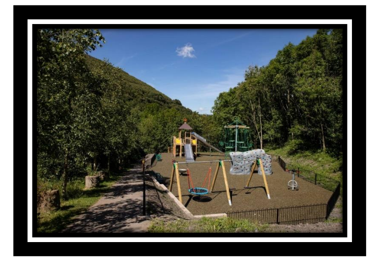
15. New Adventure Play Area at Cwmcarn Forest