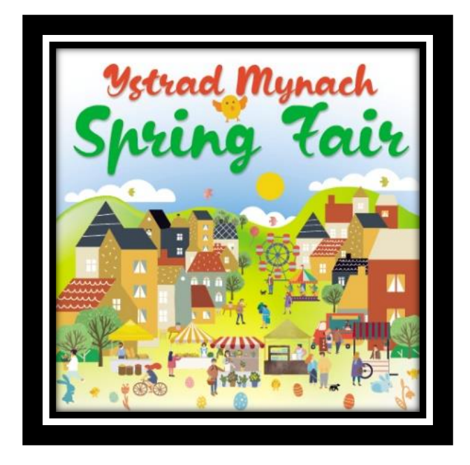
12.- Ystrad Mynach Spring Fair

In addition the Caerphilly Food Festival took place in May 2022 for the first time since lockdown and was back to its full capacity in terms of entertainment, stalls and activities. It was the first event since lockdown whereby all restrictions were lifted so a 'normal' event was permitted to be hosted with no hindrances to the layout. The event increased footfall with an attendance in the town centre of 13,949 compared to the previous Saturday of 1,588.