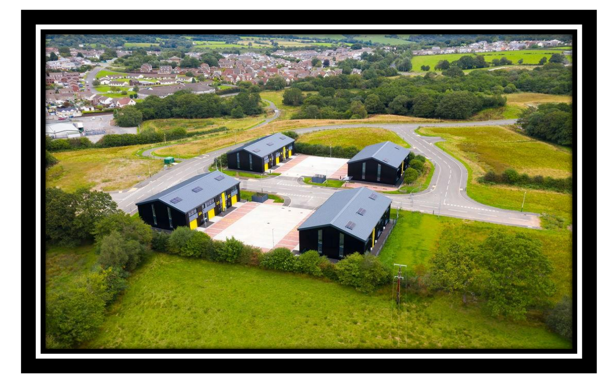
16.- Whitebeam Court, Ty Du, Nelson