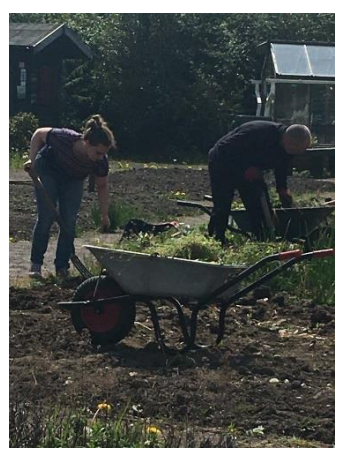
3. Tarragon Centre, Bargoed