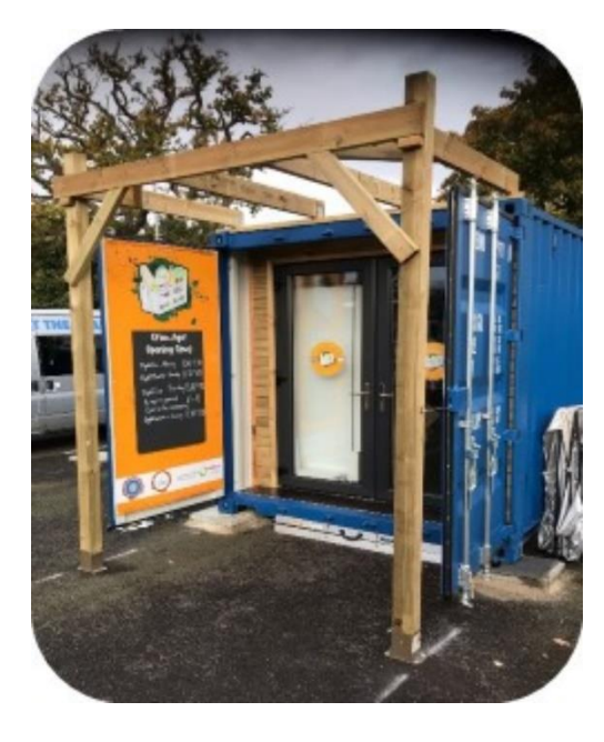
21.-Big Bocs Bwyd

Several partners from the Green Spaces Group have been involved with Big Bocs Bwyd and Food for Life initiatives which actively contribute to one of the Green Spaces Group priorities which is the Grow it, Cook it and Eat it. Valleys Regional Park has been supporting the roll out of Big Bocs Bwyd school food and growing projects with 3 schools in the Caerphilly area