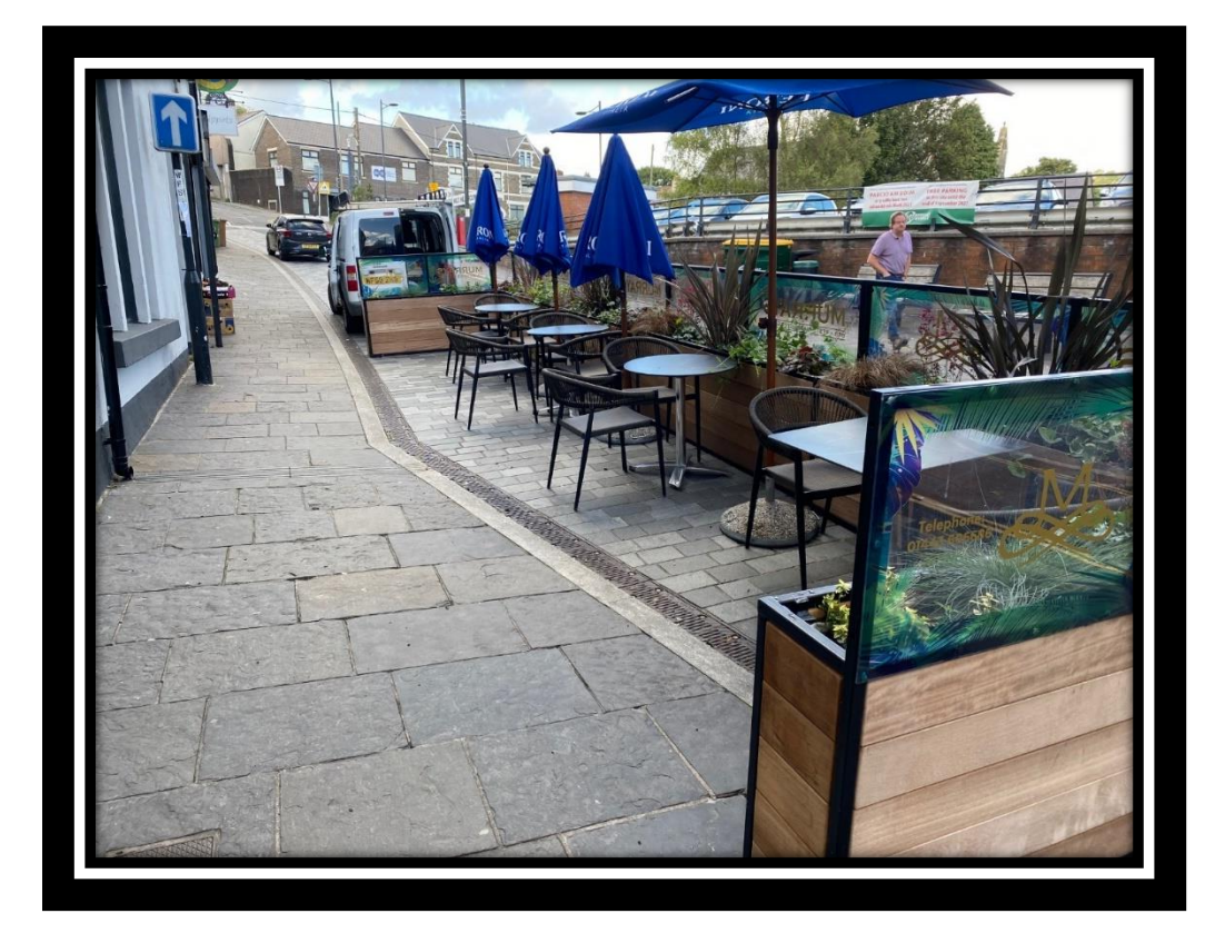
11.- High Street modifications- New Parklet 2

The focus now is to provide support and action to enable our towns to recover whilst continuing to support the Wellbeing Objectives set out in the Corporate Plan 2018-23. The economic recovery framework has been prepared to deliver on this strategic objective.