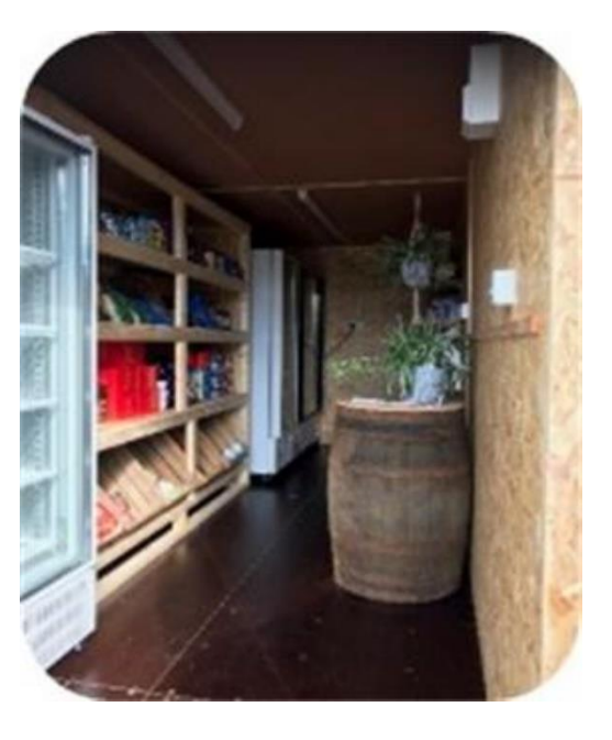
22.-Big Bocs Bwyd 2

VRP continues to work strategically on issues like a Valleys wide, Local Authority verge management framework, green social prescribing and the development of the National Nature Service concept. In Caerphilly VRP has been supporting the evaluation of the Nature Prescribing Pilot with a range of partners such as the Aneurin Bevan integrated wellbeing network, Wildlife Trust, Groundwork Wales to name a few. The Wellbeing Work hub is also well on the way to completion at Parc Bryn Bach which will provide a spectacular remote working environment for the area.