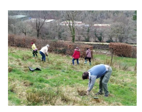
1. Tree planting Return to main contents page

The Volunteering Action Area has retained links with other priorities within the Well-being Plan and, has been able to add value to a number of activities throughout the year including working closely with the Integrated Wellbeing Network programme and culminating in the support for the Green Spaces Tree Planting Initiative which engaged 105 volunteers from the community, groups and statutory sector helping to plan 4,500 saplings.